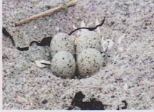
Four plover eggs on Higgins—future Higgins Beachers!