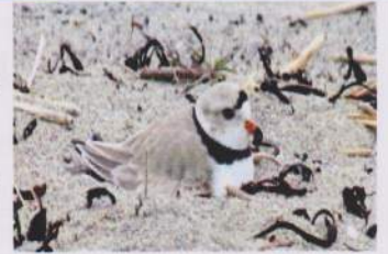
One of our resident plovers sits on her nest.