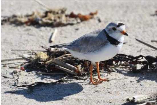
Adult Piping Plover